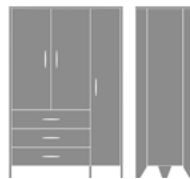
EXAW33R 45W 23.25D 71H