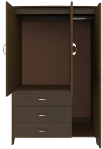
Model: EXAW33R 45W 23.25D 71H

The contemporary Essex collection features a distinctive leg design providing a dimensional look that allows for easy cleaning. Select tone-on-tone or contrasting wood-grained finishes for legs and top. Customizable and available in a variety of sizes. Sophisticated hardware delivers added style.